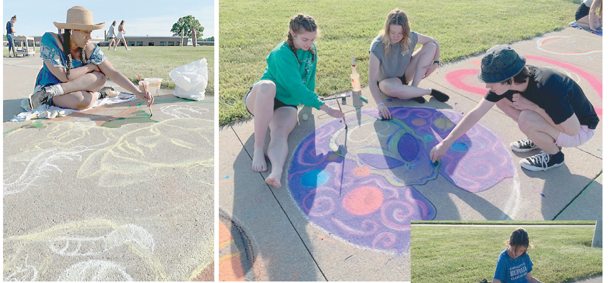
As part of the "Chalk YOUR Walk Competition," upward of 60 Lewiston-Porter High School students are creating about 20 murals outside their classroom building.